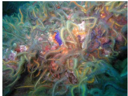
Spanish Shawl Nudibranch & Brittle Stars – Anacapa Island