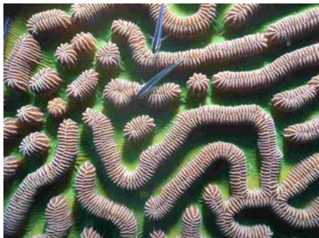
Brain Coral & Cleaner Fish – Roatan, Honduras